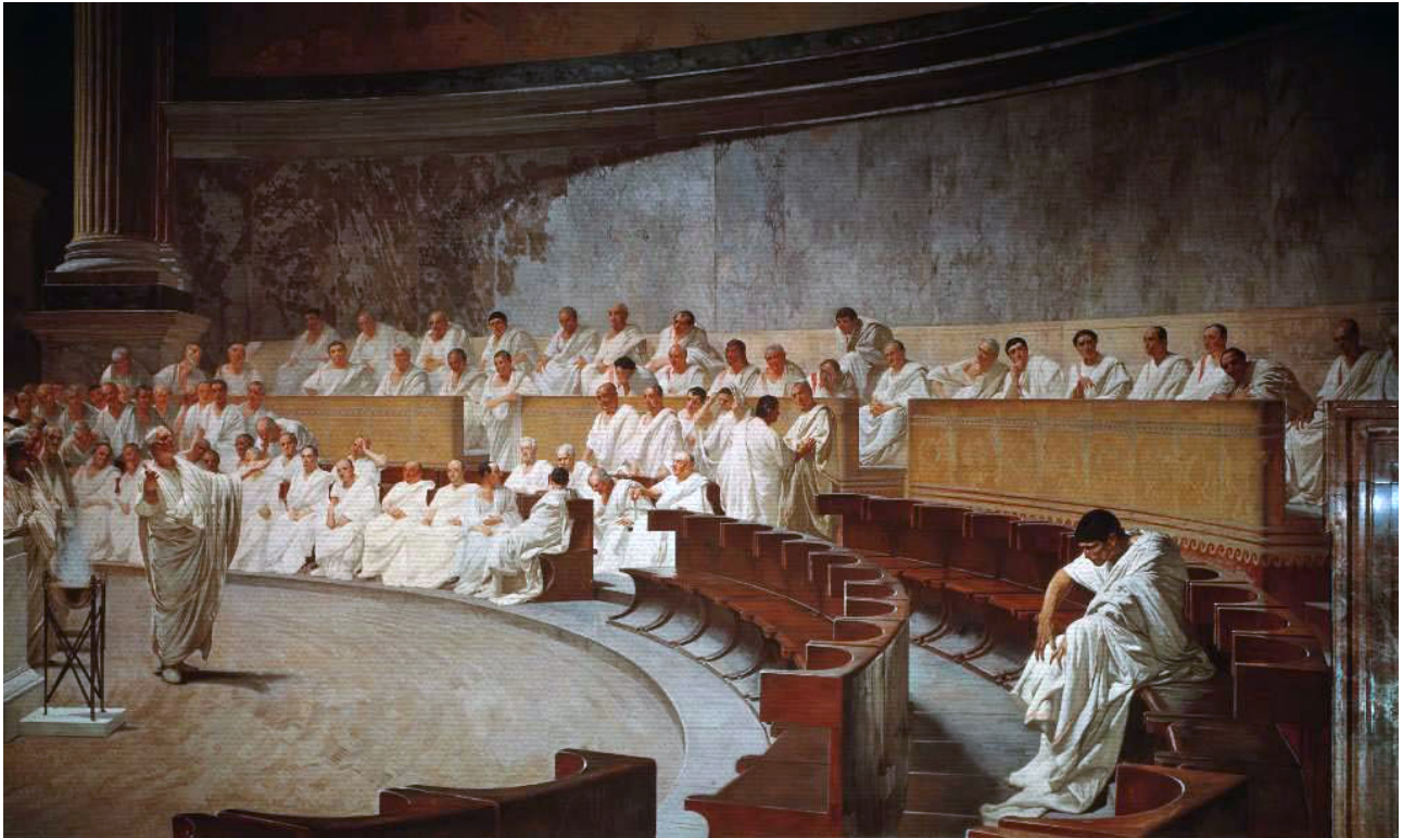
Cicero denounces Catiline, fresco by Cesare Maccari, 1882-1888