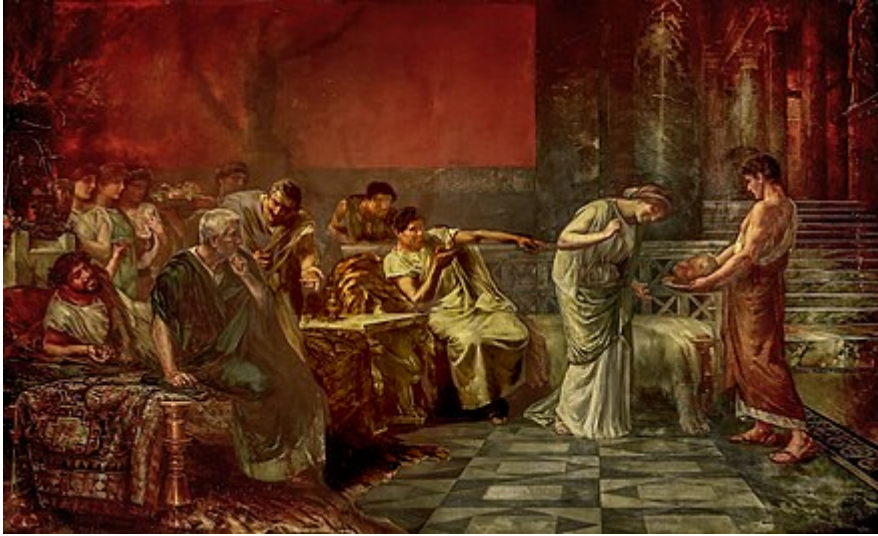
The vengeance of Fulvia by Fr. Maura y Montaner, 1888, depicting Fulvia inspecting the severed head of Cicero