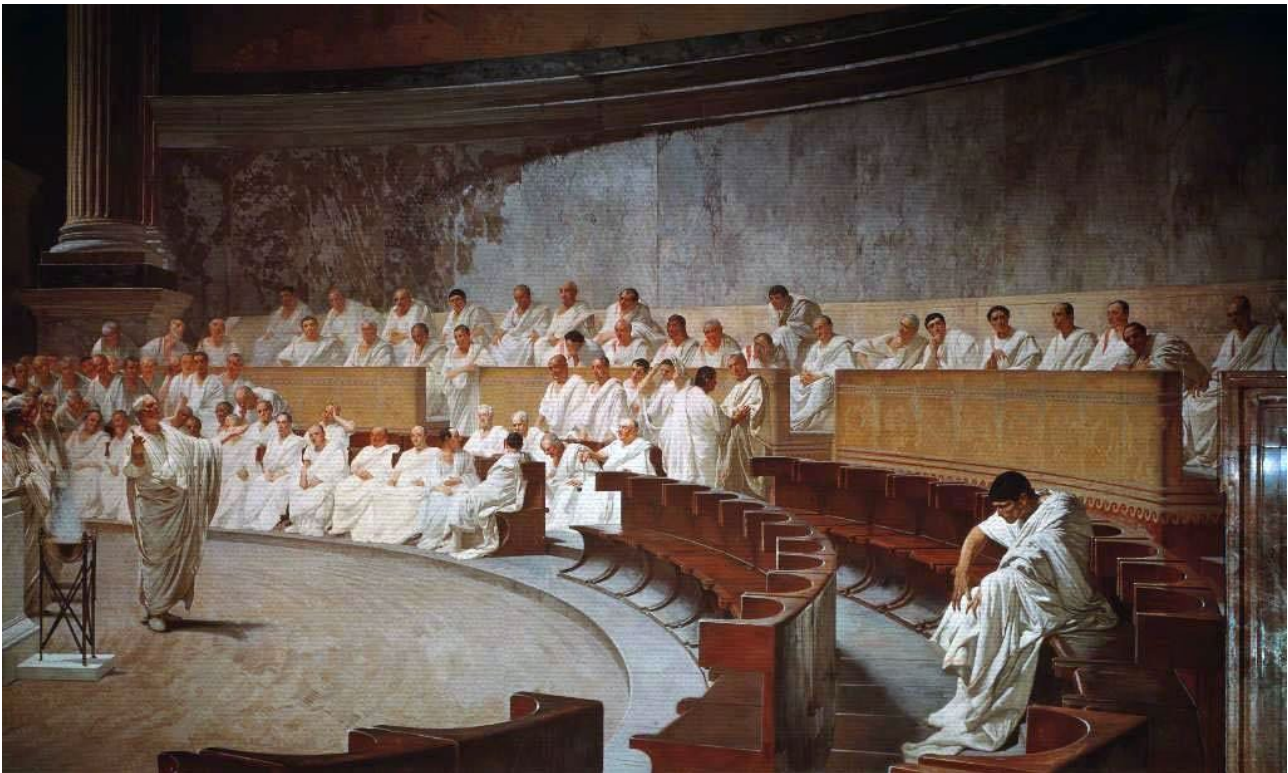
Cicero denounces Catiline, fresco by Cesare Maccari, 1882-1888