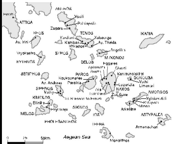
2. The Cyclades (after Lemos & Kotsonas 2020, Map 13)