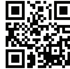
Scan to visit our website

Tel: 617 868 8200 | Fax: 617 868 8207 info@cyathens.org | www.cyathens.org