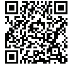
Scan to stay connected with CYA